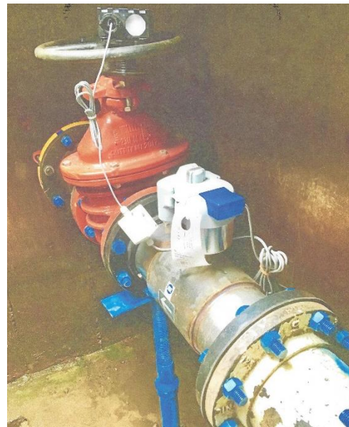
Mag Meter Installation

With the current operation of WBWCD’s potable water system, flow data is only collected monthly so this only provides the District with a snapshot of water flow. By installing meters that continuously communicate with a central database, flow data on a daily and hourly resolution will be captured. This data will be very helpful for the District in understanding peak day water use and encouraging conservation with its customers.